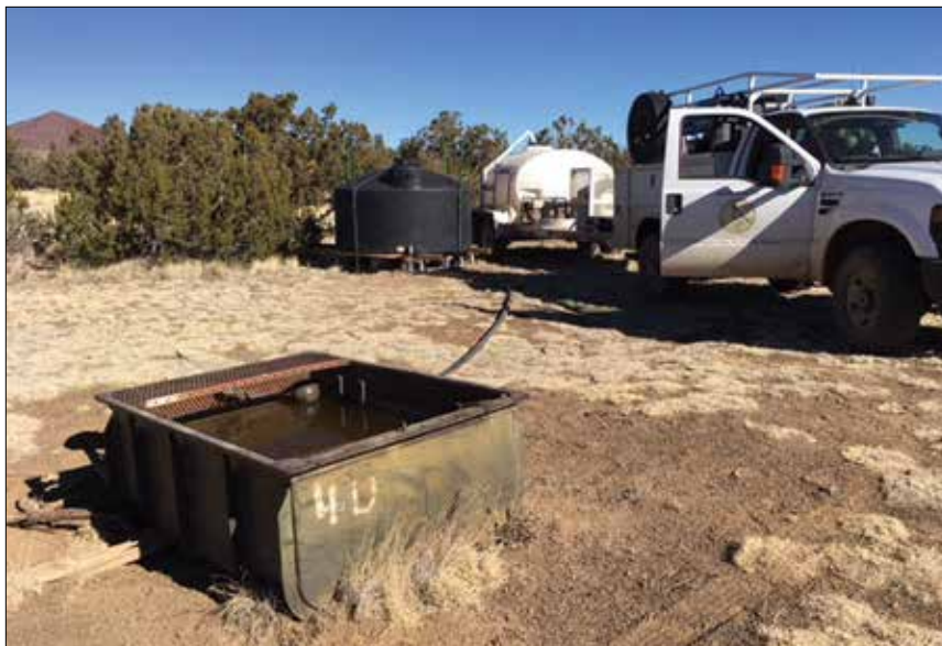
New Plumbing for a Storage tank on the Pat Springs Pipeline

Feb 28 – Attended the monthly 4FRI Stakeholder group meeting, receiving updates on current harvesting and burning activities in the 4FRI footprint, geared towards improved fire protection, habitat restoration, improving opportunities for the wood products industry and other restoration goals