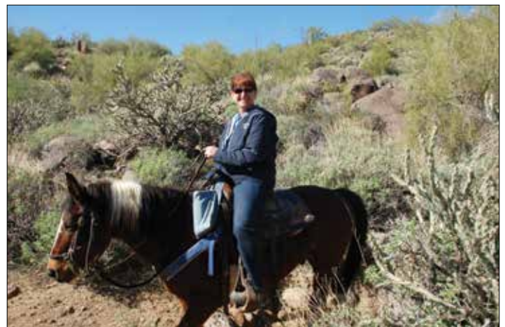
A BOW Deluxe participant enjoys the trail ride in our iconic Sonoran Desert at Saguaro Lake Ranch

Hosting the conference was a personal challenge and (I am not going to lie) a whole bunch of stress for me. These ladies are my peers and I wanted to show off our program and our state. Shuttles to and from the airport were arranged as well as 'Road Trip Morning' and 'BOW Outdoor Adventures'. Our amazing Arizona team of volunteers came through once again and we had the bonus of perfect weather. The delegates loved our hospitality and headed home with memories of February sunshine and tools to make their program better. North Carolina hosts the next conference, scheduled for 2017.