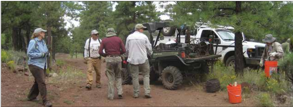
Modifying Fences for Pronghorn

Aug 25 – Attended the Annual meeting of the Northern Arizona Shooting Foundation, the operating entity for the AZGFD Northern Arizona Shooting Range (NASR), where I was elected to a three year term as a Director at Large