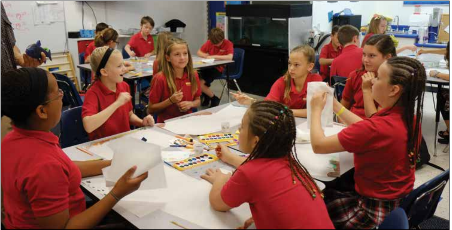
Students at Foothills Academy in Cave Creek

“They’re hatching!” “Cool.” “Awesome!” “Yesterday they were just eggs!” “We need to take care of the little fishes now.”