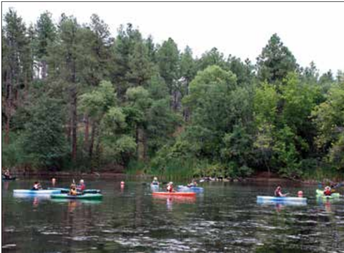
The Paddling class practices maneuvers at Friendly Pines Pond

In 1995, the Arizona BOW founders discovered the camp and saw it as the perfect place for our program. It could accommodate 100 participants plus instructors with classrooms as well as sleeping areas. Each cabin has bathrooms, heat, showers and bunks. Campers need to bring their own bedding and toiletries. There is a private pond for fishing and paddling classes, an archery range, the always popular horseback trails and high ropes course. Perfect. In the philosophy of, 'Why fix what isn't broken?', we have stayed there from the get go. So, each year at the beginning and the end of the Friendly Pines season, the women invade the children's camp.