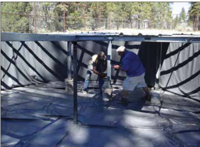
AES volunteers repair a trick tank in Unit 9

Nov 13 – Attended the Community Open meeting of the Diablo Trust and I made a presentation on some of the years accomplishments relative to wildlife and carrying capacity on the ranches