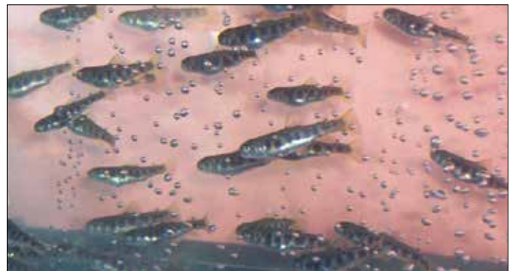
Small Fry Fish in a Tank

For more information on Trout-In-the-Classroom and Trout Unlimited in Arizona visit www.aztic.org and www.az-tu.org .