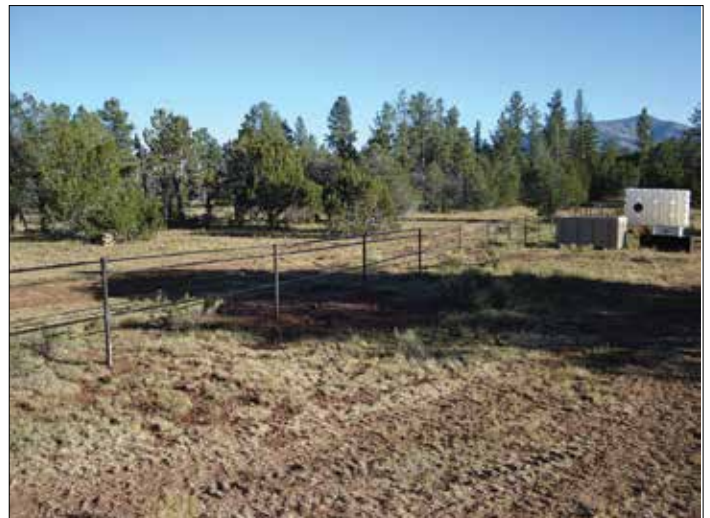
New welded pipe fence at a trick tank in Unit 7W