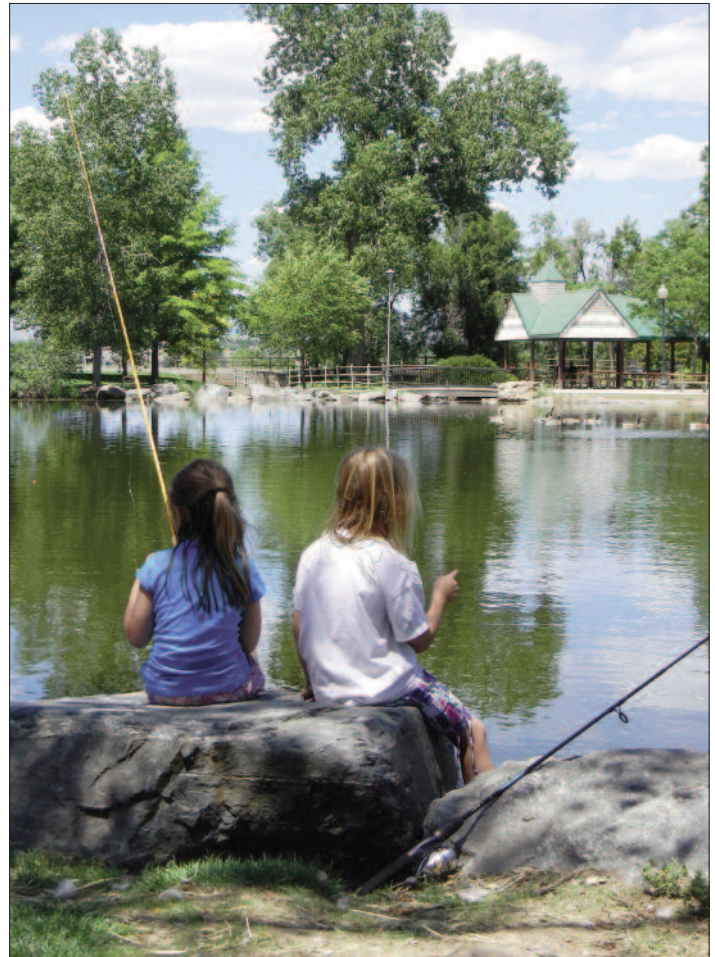
The next generation of anglers and hunters are relying on today’s sportsmen to conserve fish and wildlife habitat so they have the same opportunities to recreate on public lands.

lands claim that westerners believe federal management of the lands constrains natural resource development, thus depriving states of the economic benefits. In fact, the measures contradict the majority of western public opinion and threaten the region’s economy, which benefits from the diverse businesses attracted and supported by conserving