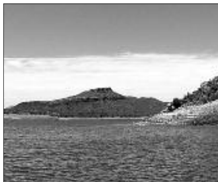
Verde River Greenbelt Clean Up The Arizona Wildlife Federation was

provided 31,000 hours of volunteer labor, without which the program could not be completed. Anglers United provided $100,000 and AGFD $75,000. Information provided by the Cave Creek Ranger district.