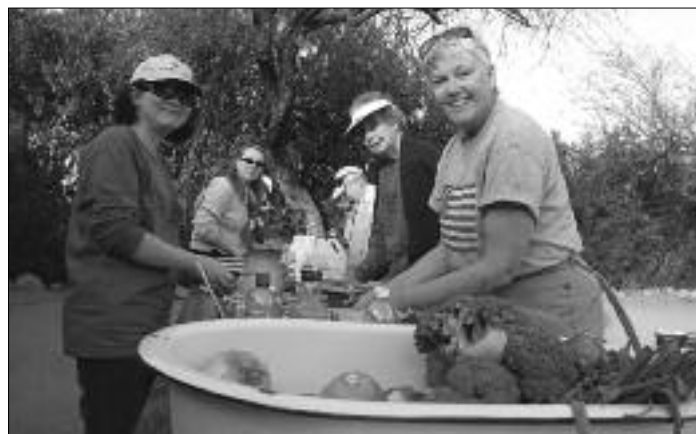
The Dutch Oven class prepare the Saturday evening meal