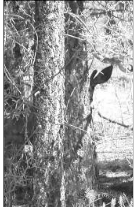
Mule Deer Tree

It is our goal to provide a well-written informative magazine and your feedback will help us do that. This is your magazine, let us hear from you.