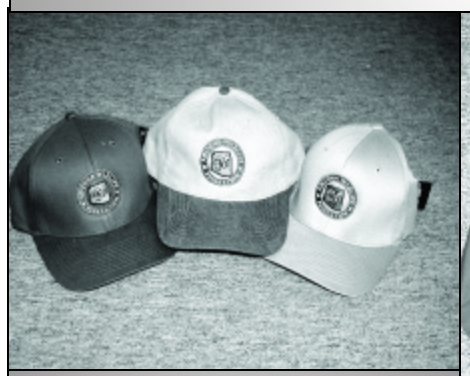
Denim shirts (long and short slv) $45 Men's Polo's $40 Ladies Twill shirts (lg & sh slv) $45 Men's Twill shirts (lg and sh slv) $45 Green hats $20