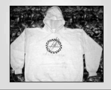
Poacher Chronicles<sub>TM</sub> Outerwear Tee-shirts ($10.95) Sweatshirts ($26.95)

any outer wear, a portion of the sales goes towards the purchase of body armor for our wardens throughout the country through the International Association of Naturals Resources Crime Stoppers Organization or (ianrc.org).