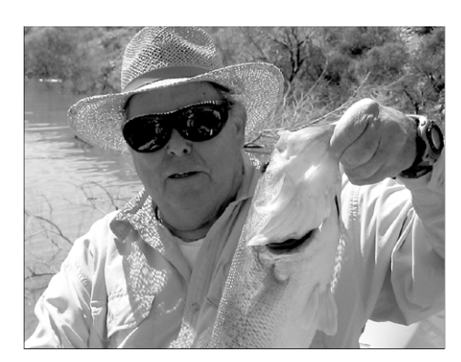
Roosevelt Lake Bass

http://www.fs.fed.us/r3/tonto/home.shtml for more information.